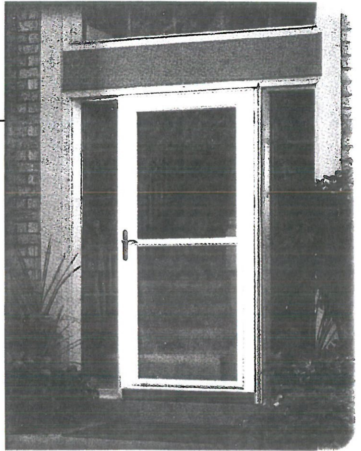
Self storing screen